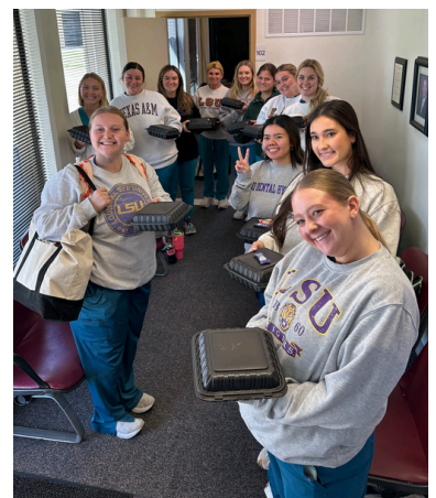
Dental hygiene students are pictured from Alexandria (above) and New Orleans (left).

Celebrating Dental Hygiene Heroes: All dental hygienists and dental hygiene students at both the New Orleans and Alexandria programs were treated to lunch in recognition of National Dental Hygiene Month.